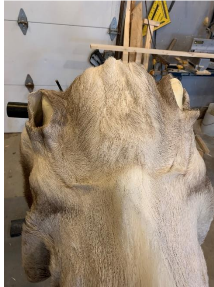
Caribou cape with legs cut too short.

The four required cuts. Tubing the leg is preferred over cutting the back open.